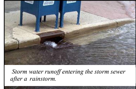
Storm water runoff entering the storm sewer after a rainstorm.

Storm drains lead directly to nearby streams and lakes without any type of treatment. Storm water entering storm drains or catch basins in the City of Ferrysburg ultimately reaches the Grand River and Lake Michigan.